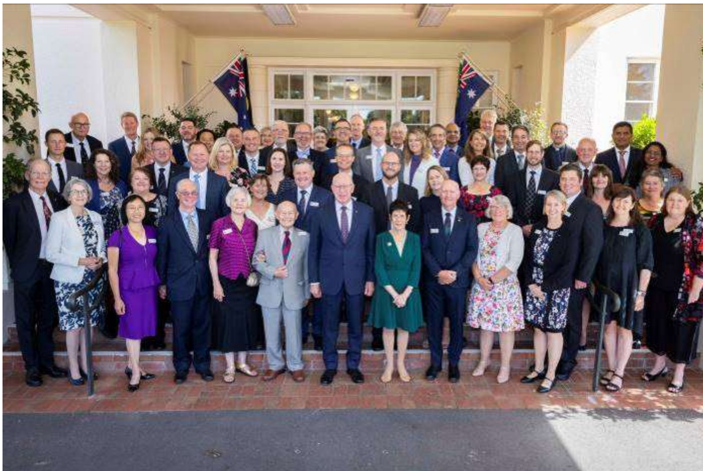
Invited guest and spouses with the Governor General (a former MCF-A Patron) and Mrs Hurley at, Government House Canberra

SAVE THE DATE: Saturday 31 st August - there will be an informal dinner in Canberra for everyone to help celebrate 40 years of MCF-A. Those that can't make it to Canberra are encouraged to organise an event in their area on the night. More info below and in coming months.