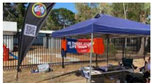
Puckapunyal Welcome Event

We cannot force someone to hear a message they are not ready to receive, but we must never underestimate the power of planting a seed.