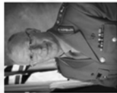
General David Hurley, AC, DSC Chief of the Defence Force (CDF) Patron - Military Christian Fellowship of Australia