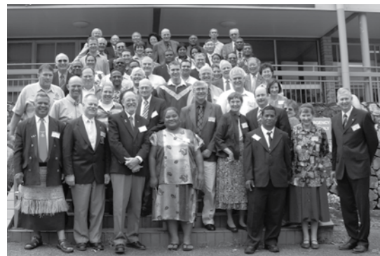
AMCF Pacific Conference Participants